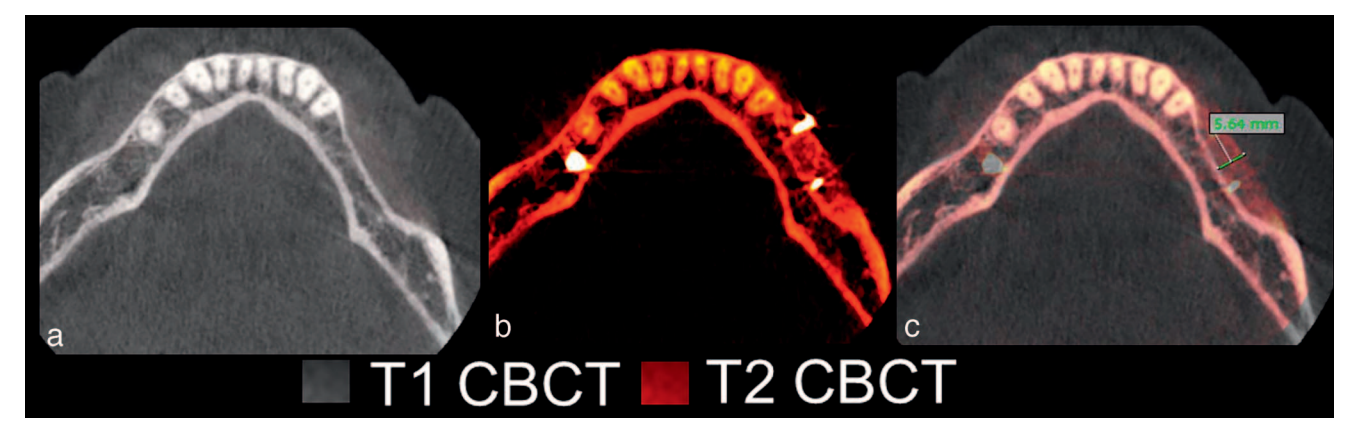
FIGURE 2. (a) T1 axial slice presurgery showing resorbed ridge. (b) T2 axial slice after horizontal bone graft. (c) T1 (gray) and T2 (red) axial slices superimposed showing the amount of bone gained after surgery. Because superimposition was done, the slices being compared are exactly the same. CBCT indicates cone-beam computerized tomography.

bone volume for implant placement was observed on a new CBCT. To accurately and objectively assess the gain in bone volume, a superimposition analysis was made using OnDemand 3D software (Figure 2).